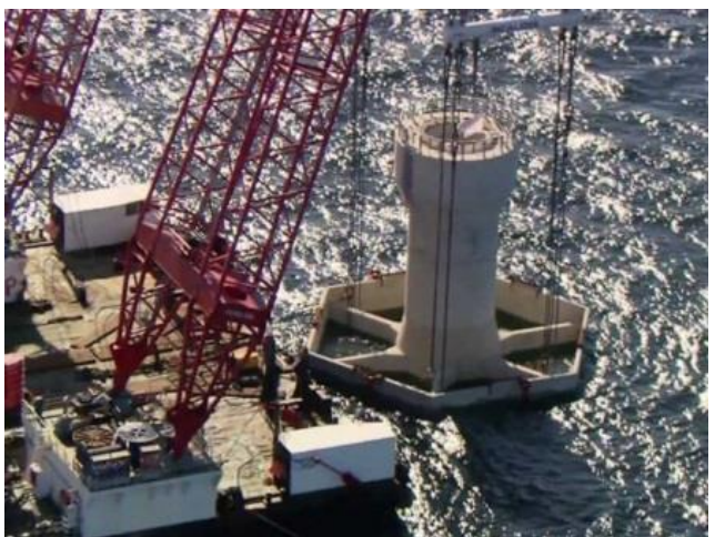
Fig. 5. Installation of the supports (Ruiz de Temino Alonso, 2013)

The installation process is positioning and levelling of the offshore platform according to the design drawings and assembling the different components of the structure in order to make it a stable structure (Muyiwa & Sadeghi, 2007). There are two techniques for installation of the structures which are an individual installation by using the heavy left vessel and installation of several supports by loading them on semisubmersible barges. The first technique is used when the construction occurred on the onshore and dry dock while the second technique is used when the construction occurred on the semisubmersible or floating barge. In all cases, the supports are lowered and installed to the seabed by heavy lift vessel Fig. 5. The advantages of the second technique are transferring the supports by one trip, faster in towing, safer, and easier if any problem occurred due to the weather conditions (Esteban et al., 2015).