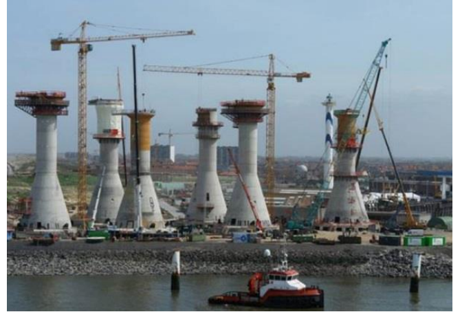
Fig. 4. Construction of supports on the quayside (Ruiz de Temino Alonso, 2013)